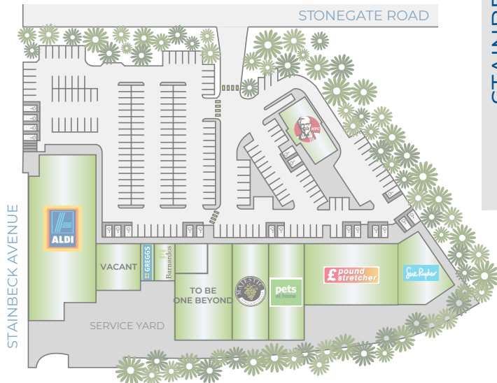
Existing (January 2023)

Extension - Planning permission granted in July 2022 to extend Aldi and reconfigure Unit 2C